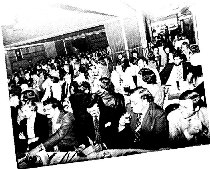
A view of the Melbourne Hotel Function Room