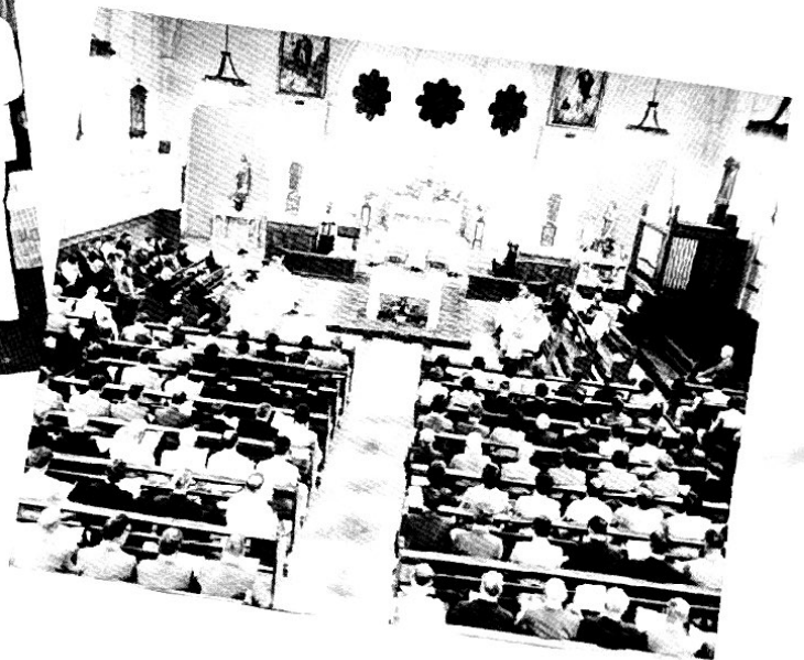
The Jubilee Mass at the Sacred Heart Church, Rosalie