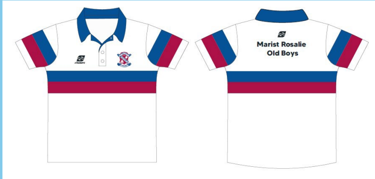
Club Polo, Performance Polo, Titanium Polo, Endurance Polo & Apex Polo